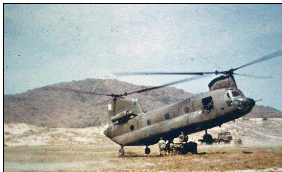
CH 47 Chinook, US Army 'Hillclimber' unit

Initially, maintenance convoys to 1ATF had armoured escort, and air and artillery support. Subsequently the route was picketed and ultimately the need for route protection was largely removed. When serious security threats emerged, or when deploying on operations, full security was arranged, including US gunships overhead. During all movements, strict convoy discipline was maintained.