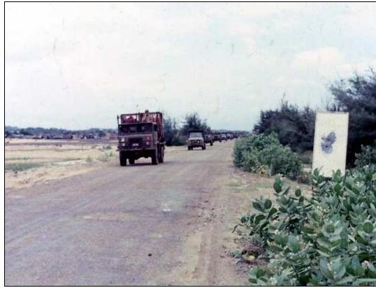
1 Company 1966 - 67

Despite constant ongoing challenges, the operational support and maintenance systems functioned effectively for the full year. Importantly, support systems for 1ATF operations were well honed, including daily air support missions.