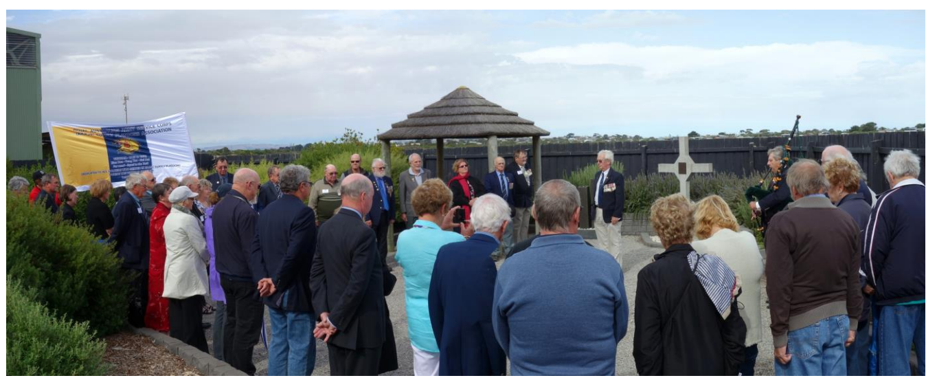
Figure 1Plaque laying Service PI 2013

Following our Thursday AGM, we all enjoyed our VSPA dinner which was superb and many took home raffle prizesthanks especially to the generous donators for their contribution.